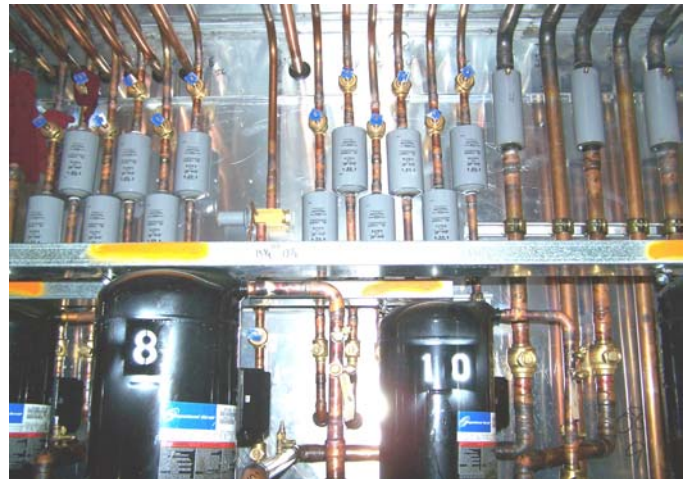
A refrigeration piping masterpiece