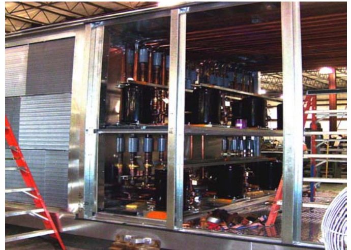
Twelve 15 ton Copeland scroll compressors,