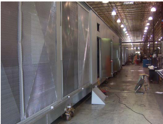
Units are tested and split in two sections for shipping.