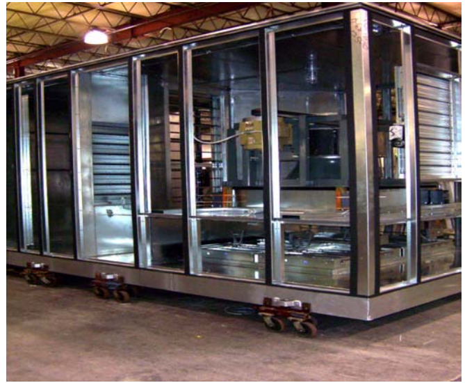
Airfoil plenum SWSI supply and return air blowers with premium efficiency motors.