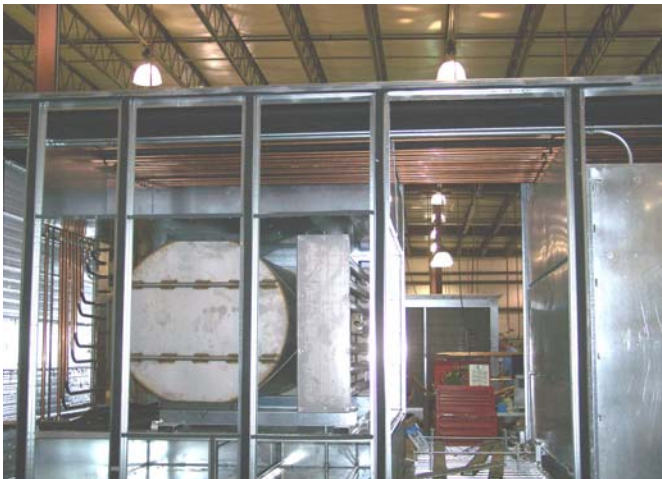
2,800 MBH gas heat power burner with stainless steel heat exchanger.