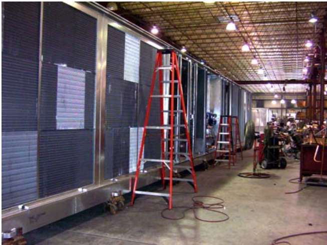
The 202 ton unit will be built in two sections with all refrigeration piping in tact.

New York City School Construction Authority (NYCSCA) engineers have been working with a few custom HVAC manufacturers to come up with the most efficient, long-lasting systems that a technology can offer for their schools. Seasons-4 is proud to be one of those preferred manufacturers.