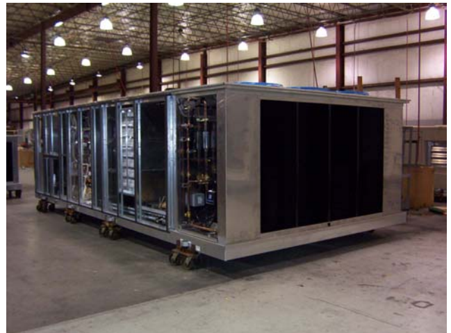
New Unit In Production